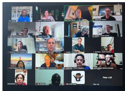
(This is a screenshot of one group of attendees at our September online meeting. Regrettably we failed to capture a photo of others who also participated.)

Ongoing prayer for this leadership team and for our entire FCAP staff is greatly appreciated.